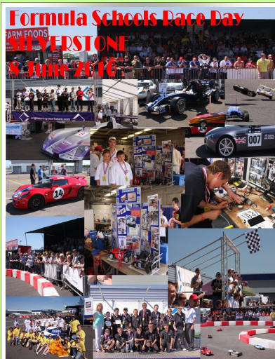
Formula Schools, brought to you by -

ENGINEERING YOUR FUTURE One Vision...Several Initiatives